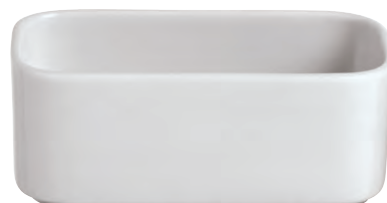
67303-64 Sugar bags holder