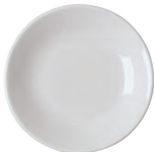
67303-20 Sauce plate