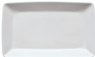
67303 Flat rectangular plate

Q82 9 x 9 cm – 3 1/2 x 3 1/2 in. Q83 12 x 12 cm – 4 3/4 x 4 3/4 in.