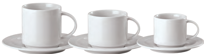
67303 Cup stackable