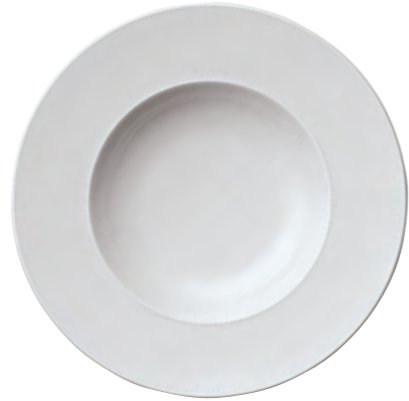
67303 Plate deep