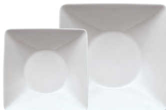
67303 Deep square plate

Q80 9 x 9 cm – 3 1/2 x 3 1/2 in. Q81 12 x 12 cm – 4 3/4 x 4 3/4 in.