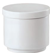
67303-62 Base sugar bowl