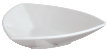
67303M03 Small dish "Trident"

14 x 7 cm h 2 cm 5 1 / 2 x 2 3 / 4 in. h 3 1 / 4 in.