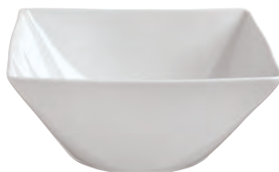
67303 Squared bowl

Q29 18 x 11 cm – 7 x 4 1/4 in. Q30 29 x 19 cm – 11 3/8 x 7 3/8 in.