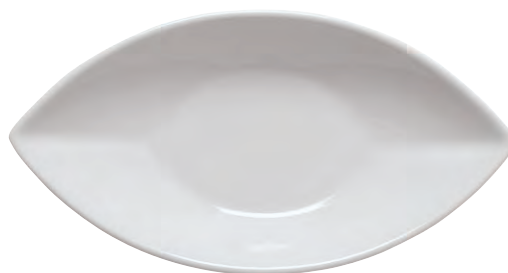
67303M02 Small dish "Gondola"

9 x 7 cm h 3 cm 3 1 / 2 x 2 3 / 4 in. h 1 1 / 8 in.