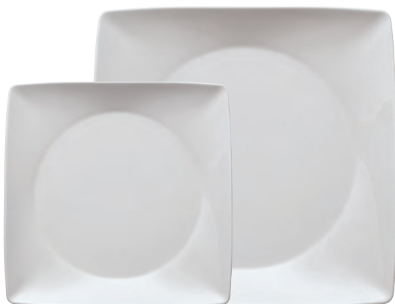
67303 Flat square plate

Q01 23 x 23 cm – 9 x 9 in. Q02 28 x 28 cm – 11 x 11 in.