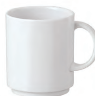
67303-44 Mug stackable with handle