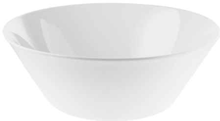
67303-85 Bowl buffet

Ø 12 cm h 4 cm - Ø 4 3/4 in. h 2 1/2 in.