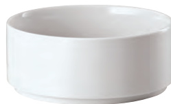
67303 Bowl stackable

Ø 35 cm h 13,5 - Ø 13 3/4 in. h 5 3/8 in.