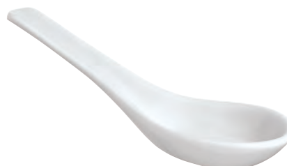
67303M07 Chinese spoon

M05 11 x 8 cm - 4 3 / 8 x 3 1 / 8 in. M06 16 x 11 cm - 6 1 / 4 x 4 3 / 8 in.