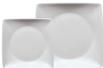
67303 Flat square plate

Q80 9 x 9 cm – 3 1/2 x 3 1/2 in. Q81 12 x 12 cm – 4 3/4 x 4 3/4 in.