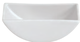
67303M01 Small dish "Seesaw"

9 x 7 cm h 3 cm 3 1 / 2 x 2 3 / 4 in. h 1 1 / 8 in.