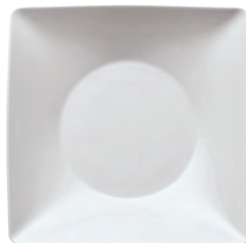
67303Q10 Deep square plate

Q01 23 x 23 cm – 9 x 9 in. Q02 28 x 28 cm – 11 x 11 in.