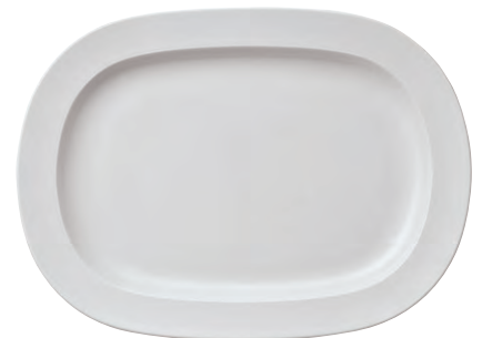
67303 Plate oval