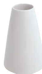
67303-86 Flower vase

-79 h 6 cm 0,20 lt. – h 2⅜ in. 7 oz. -78 h 7 cm 0,30 lt. – h 2¾ in. 10½ oz.