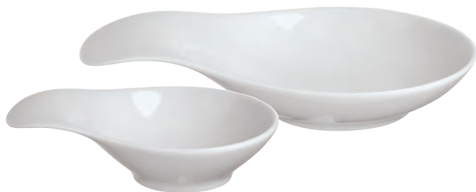
67303 Small dish "Coppetta"

Ø 10,5 cm h 2 cm - Ø 4 in. h 3 1 / 4 in.