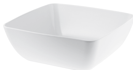
67303 Squared bowl buffet

Q84 23 x 23 cm h 10 cm 9 x 9 in. h 4 in.