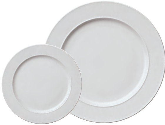
67303 Plate flat