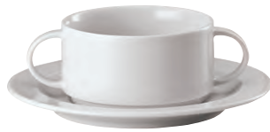
67303-23 Soup bowl stackable with handles

Ø 10 cm h 5 cm 0,25 lt. Ø 4 in. h 2 in. 8 3/8 oz.