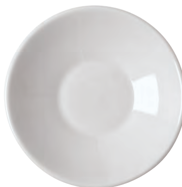
67303M04 Small dish "Rondel"

Ø 10 cm h 2 cm - Ø 3 7 / 8 in. h 3 1 / 4 in.