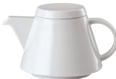
67303 Base tea pot