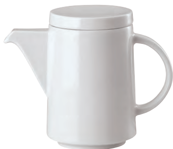
67303 Base coffee pot